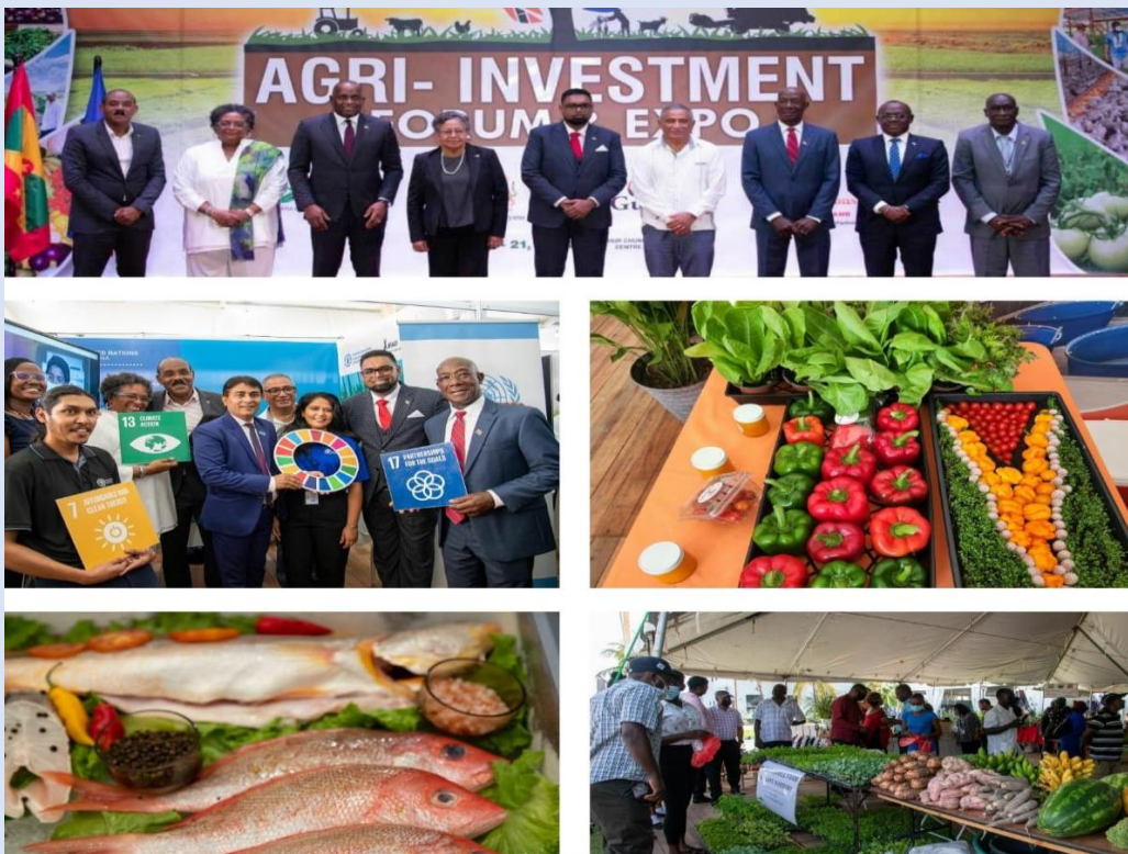
Images of the Agri-Investment Forum and Expo

The importance of the development of our agriculture sector remains high on Government’s agenda to proactively strengthen our non-oil sector. Under this administration, Guyana’s leadership in driving the food security agenda in CARICOM has been firmly restored and the recent hosting of the flagship Agri-investment Forum and Expo, in Georgetown, on 19th – 21st May 2022, further cemented our role.